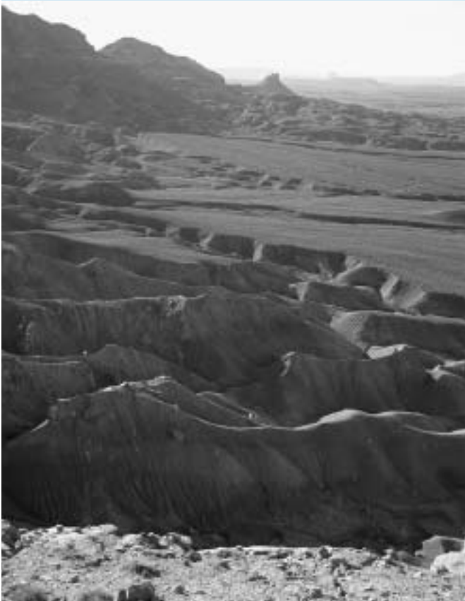
Sunrise at the edge of Kaiparowits Plateau, Grand Staircase-Escalante National Monument, Utah.

The need to check history, and make a clear-eyed decision on whether to repeat it, is most urgent when events are racing the fastest. This holds true today for energy extraction in the Southwest. In the boom times of the 1950s city leaders embarked on the Big Buildup, an intensive resource development campaign that wrote a critical part of the story of the modern West across the grand tableau of the Colorado Plateau—the Four Corners area, the canyon country, the high redrock desert. Now the Bush administration seems bent on replicating the excesses of the past and we ought to brook no doubt about what is at stake.