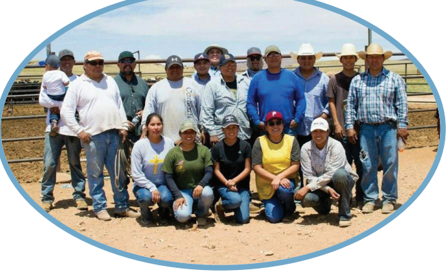
The Nockideneh and Saganitso familes oppose Escalade.