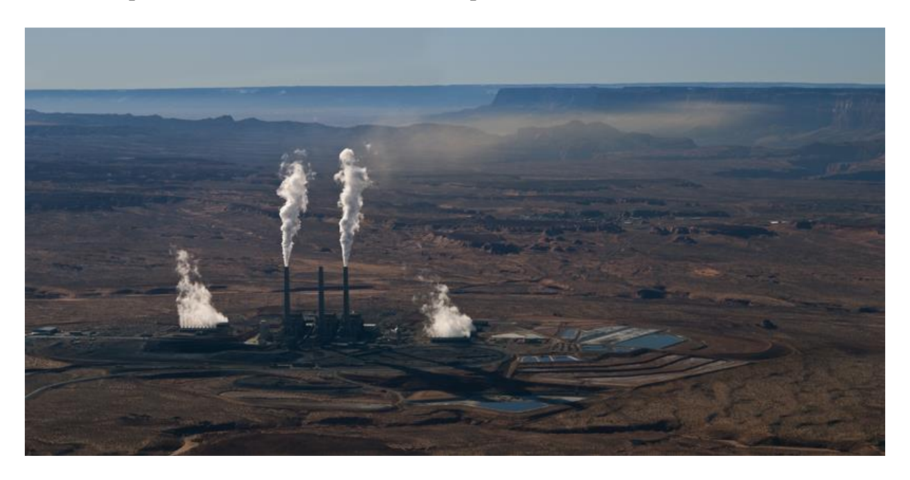
January 19, 2009. Photo of NGS looking southwest toward Grand Canyon National Park. Please note that only two chimneys are releasing emissions, because the center burner was down for maintenance. The white puffs are water vapor. The brown plume (consisting of nitrates, heavy metals, and other toxic emissions) is drifting south and into the Grand Canyon. Because only two of the plant's three units were operating at the time, the photo simulates what the pollution plume would look like after implementing a plan cut emissions by one-third by closing one coal burner at the end of 2020.

advocate to: 1) prevent NGS emissions from impairing visibility at the Grand Canyon and ten other National Parks and Wilderness Areas, 2) stop irreversible damage to water which is lifeblood to Grand Canyon's living communities, and 3) promote sustainable energy options that help to achieve economic self-determination and equity among Native American communities. Twenty-five years ago, the Grand Canyon Trust helped to negotiate an agreement to reduce sulfur emissions at Navajo Generating Station by more than 90 percent. That decision improved visibility at the Grand Canyon, sustained high-paying jobs for local residents, and produced cheap and reliable electricity for another 25 years. The Trust remains a steadfast advocate for clean air and water, cleaner energy options, and economic fairness as Reclamation considers the next 25 years of NGS and, ultimately, the retirement, reclamation, and replacement of the entire system of hydrologic, ergonomic, economic, and environmental relationships that the Final Environmental Impact Statement must evaluate.