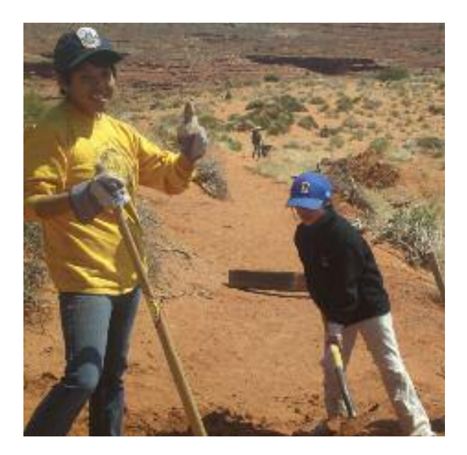
THE ELECTION OF BARACK OBAMA SIGNALS A POSITIVE NEW ERA FOR NATIVE AMERICAN COMMUNITIES AND GOVERNMENTS.

As a Native American, I sometimes drive across our lands and wonder what can be done to help us diversify our economies, especially in ways that honor our cultures and protect our lands. For too long we have built economies that are stagnant and are dependent on natural resource extractive industries—in large part due to the federal government's insistence that this is the most viable option for us. Consequently we have very little retail, manufacturing, and tourism related industry.