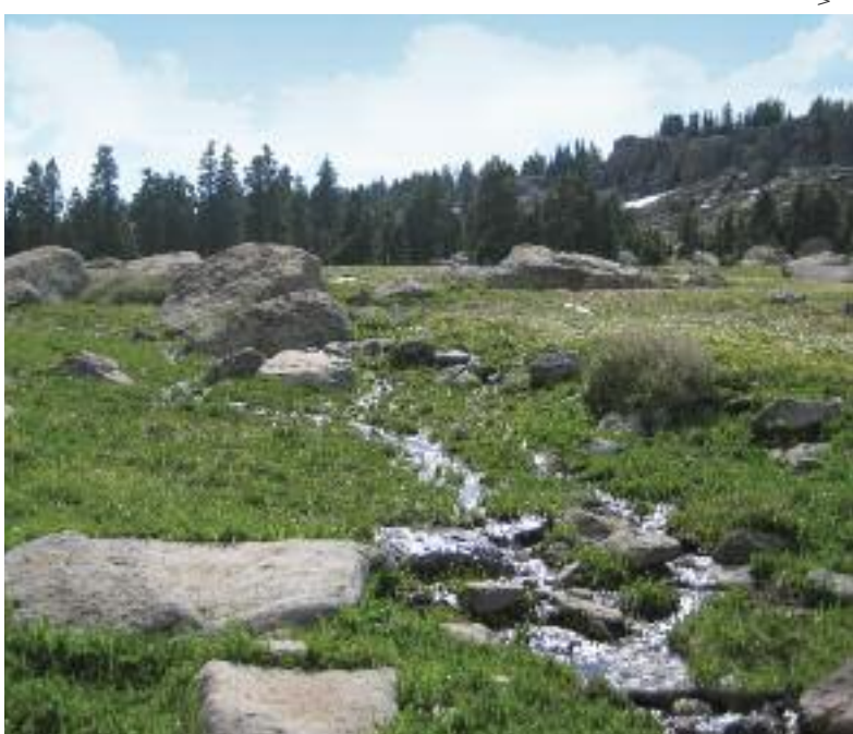
opposite page: Beavers are returning home to work their engineering miracles on Tasha Creek, Fishlake National Forest. above: Unfenced, untrampled Tasha Spring provides headwaters habitat for a special set of species, Fishlake National Forest.

In 2009 we hope to work with the Forest Service on logistics for continuing reference conditions on these sites. We will count on volunteers, such as members of the Utah Native Plant Society, to help us characterize each reference site in more detail. One member has expressed interest in helping us run some pollinator transects. Bird, mammal, and drought response surveys and other comparisons with impacted habitats are all possible in coming years.