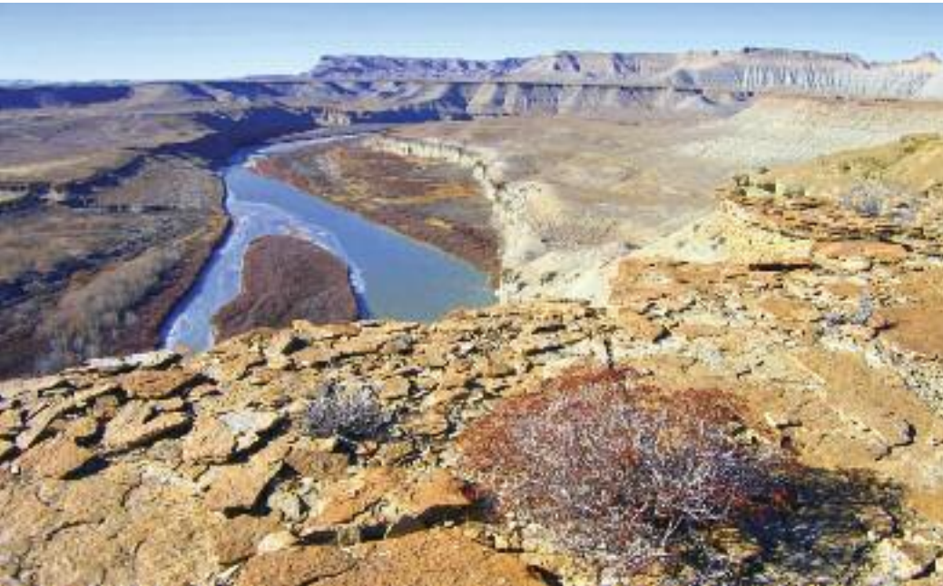
Desolation Canyon, Utah.

On this day, on the banks of the Colorado River flowing clear not muddy, with a new president that