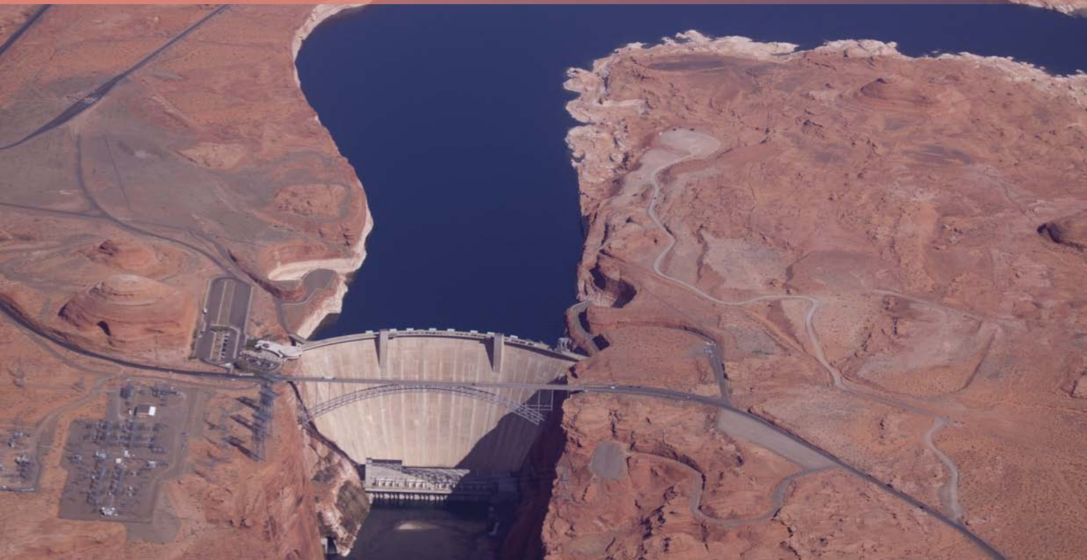
Aerial view, Glen Canyon Dam. MITCH TOBIN

For a collaborative program to be successful at least two elements must be present: There must be a well-designed process that develops policy based on facts and science, and there must be an alignment of stakeholder missions with the collaboration's goals.