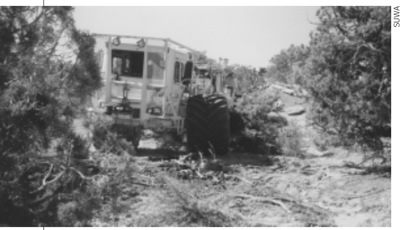
Thumper truck in canyon country, Veritas site.

"Each generation must deal anew with the 'raiders,' with the scramble to use public resources for private profit, and with the tendency to prefer short-run profits to long-run necessities. The nation's battle to preserve the common estate is far from won... On the one hand, science has opened up great new sources of energy... On the other hand, new technical processes and devices litter the countryside with waste and refuse, contaminate air and water, imperil wildlife and man and endanger the balance of nature itself."