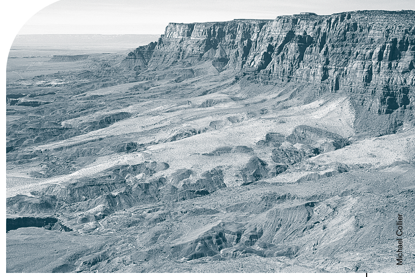
Vermilion Cliffs National Monument and Paria Plateau above Marble Canyon.

Much of this energy infrastructure was put in place in the 50s and 60s, perhaps before we clearly understood all the environmental implications. But sometimes it seems like the more things change, the more they stay the same. Under the guise of a national energy "crisis," the Colorado Plateau has once again become the bull's-eye on a target