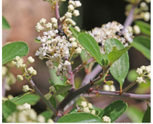
KIKH ANDREY ZH