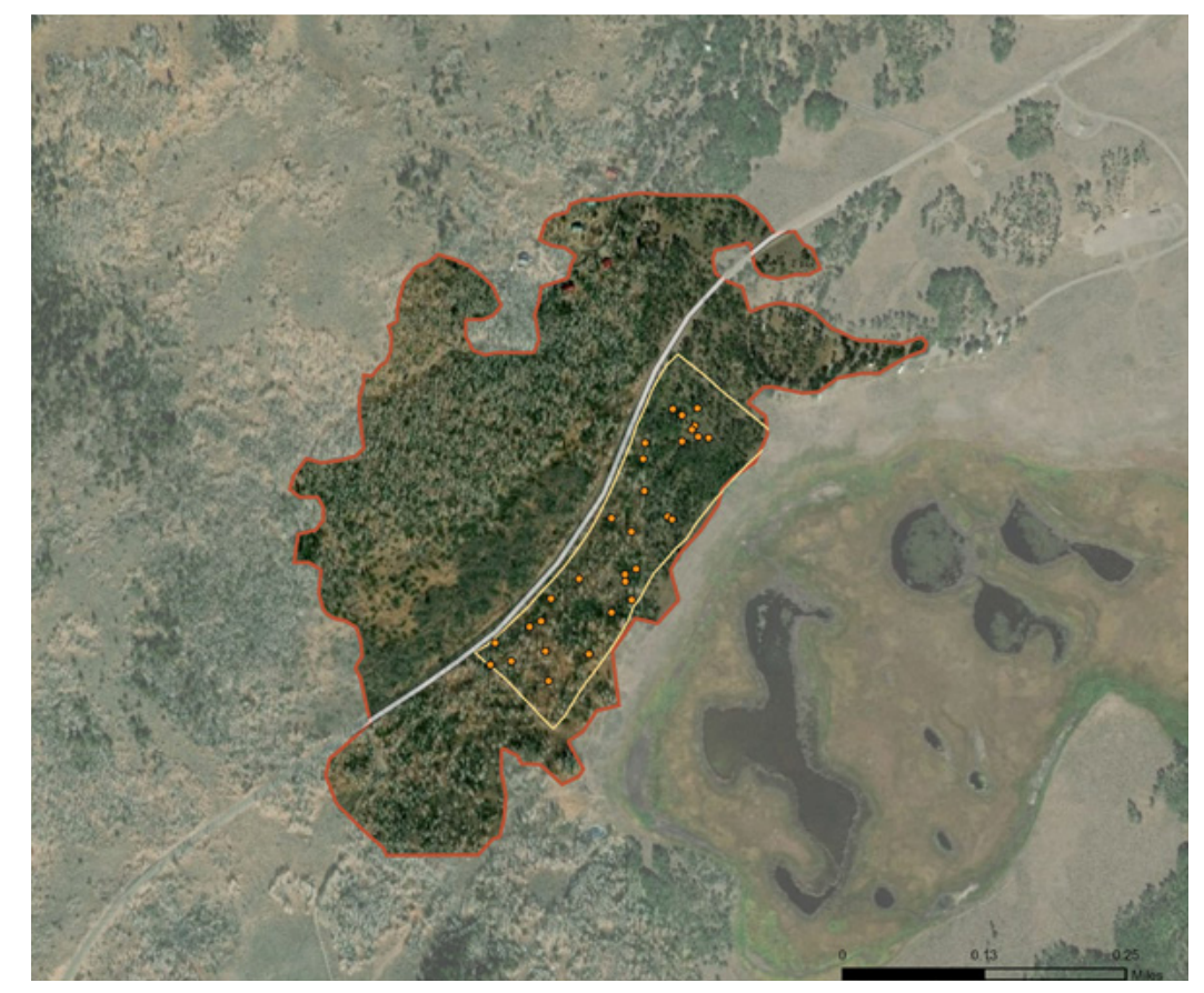
Fig. 1. Location of photopoints within the Pando Clone exclosure. Map by David Vines, Grand Canyon Trust.

To document the anticipated recovery of aspen within the fenced exclosure (see map in Fig. 1), Trust staff and volunteers established 30 randomly located photopoints where we would take photos over time, beginning in 2014. At each point, photos were taken in the north, east, south, and west directions. GPS coordinates were recorded which enabled us to return to that same point and take repeat photos every year from 2014 to 2019. We used past photos to help us capture the same area in each photo. We re-took the photos at all 30 points, in all four directions, on these dates: