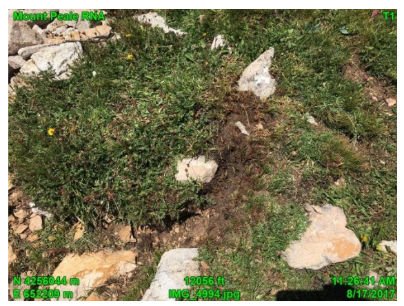
Figure A2. Mountain goat-sheared alpine turf and ground disturbance.