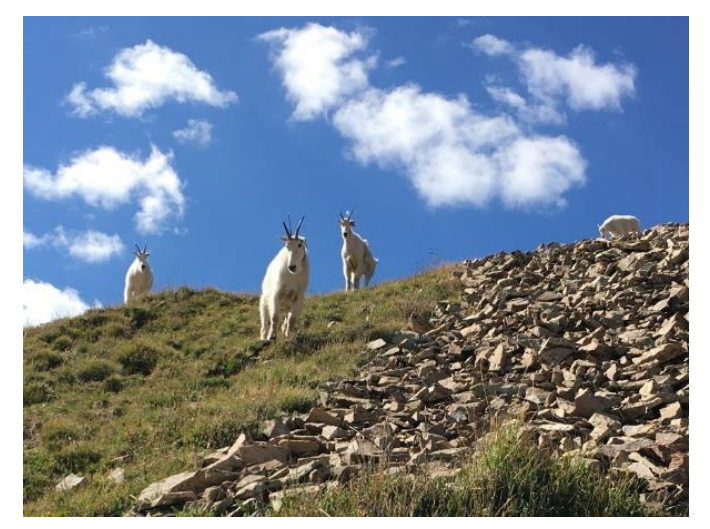
Fig. 2. Goats in the Mount Peale RNA of the La Sal Mountains (photo by Marc Coles-Ritchie, August 18, 2107).

Over the objection of the Forest Service, mountain goats were transported by the Utah State Division of Wildlife Resources (UDWR) from the Tushar Range to a patch of State land on a south slope of La Sal Mountains in 2013 and 2014. The goats soon moved up to the high elevation alpine area, their preferred habitat, which includes the Mount Peale Research Natural Area (RNA). RNAs, notes the Forest Service, "are permanently protected and maintained in natural conditions, for the purposes of conserving biological diversity, conducting nonmanipulative research and monitoring, and fostering education" (Forest Service RNA web page).