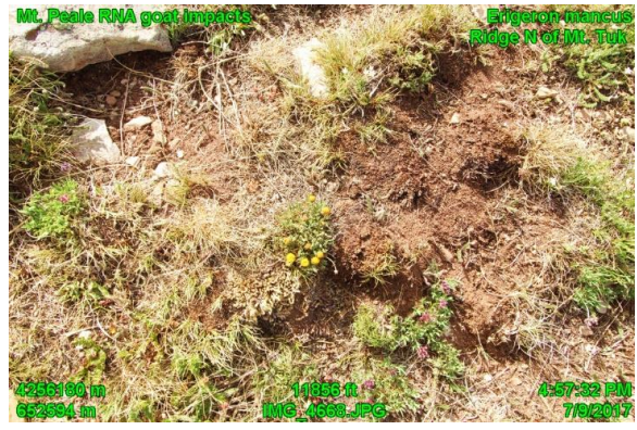
Figure A3. Trampled and grazed plants in area with endemic La Sal daisy (yellow flowers).