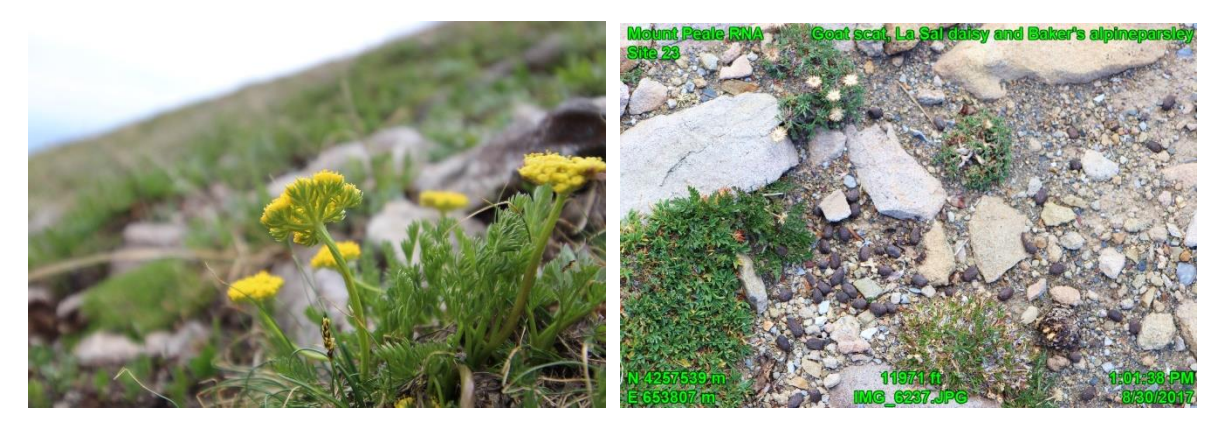
Figure B2. Baker's alpineparsley ( Oreoxis bakeri ) in bloom (yellow flowers in left photo) and surrounded by mountain goat scat and ground disturbance (right photo). La Sal daisy ( tan, senesced flowers ) is also present in right photo.