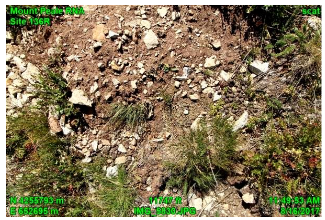
Figure A1. Mountain goat scat, ground disturbance and grazed alpine plants.