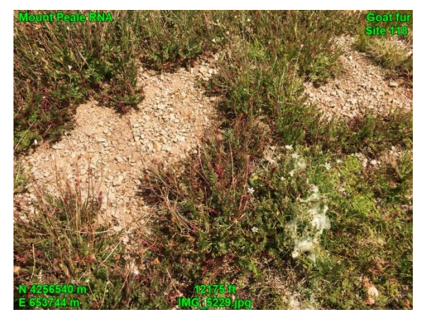
Figure A5. Mountain goat fur (white cotton-like material caught in plants) and ground disturbance.