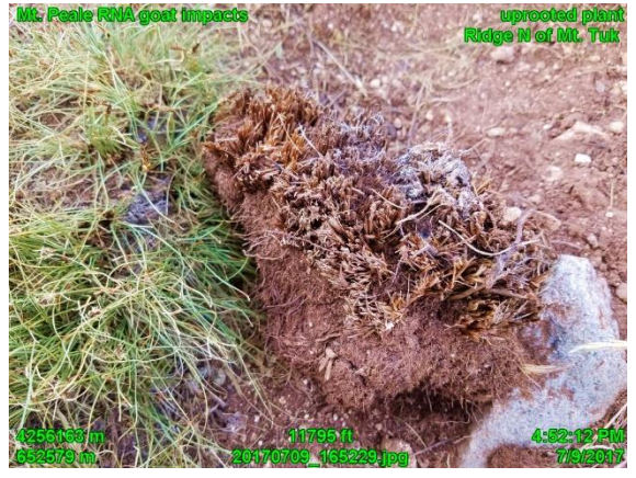
Figure A6. Uprooted plants and ground disturbance, presumably by mountain goats.