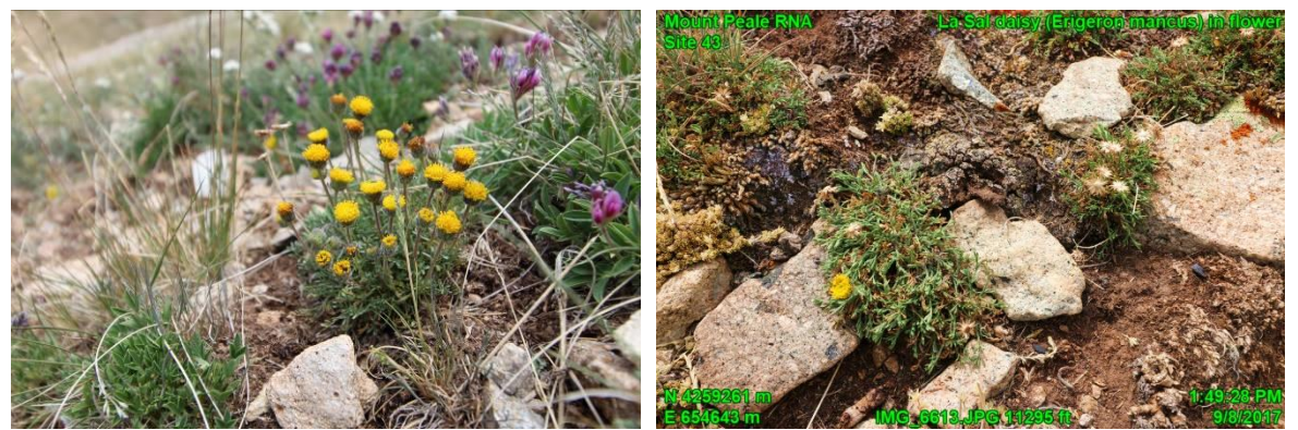
Figure B1. The endemic La Sal daisy ( Erigeron mancus ) in bloom (yellow flowers in left photo) and surrounded by ground disturbance from mountain goats presumably (right photo).

"Endemic" plants are only found in a certain geographical area, in this case the La Sal Mountains, and nowhere else in the world. A "sensitive" plant is a designation by the US Forest Service, Region 4 in this case, for plants whose population viability is of concern.