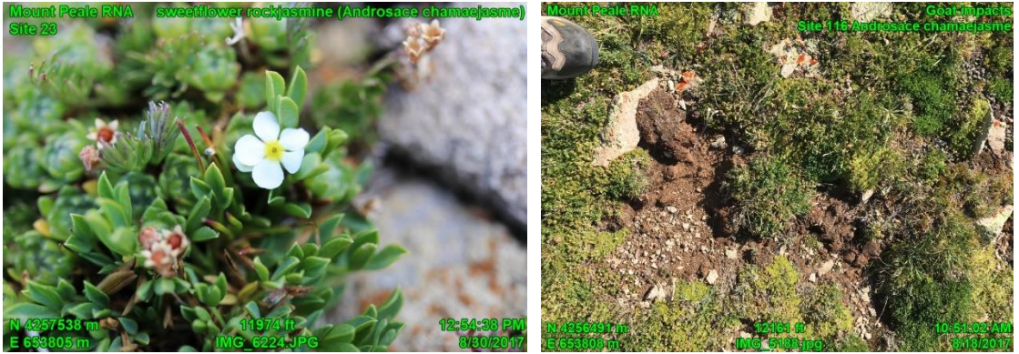
Figure B34. Sweetflower rockjasmine ( Androsace chamaejasme ) in bloom (left photo) and surrounded by ground disturbance by mountain goats (right photo).

Figure B2. Baker's alpineparsley ( Oreoxis bakeri ) in bloom (yellow flowers in left photo) and surrounded by mountain goat scat and ground disturbance (right photo). La Sal daisy ( tan, senesced flowers ) is also present in right photo.