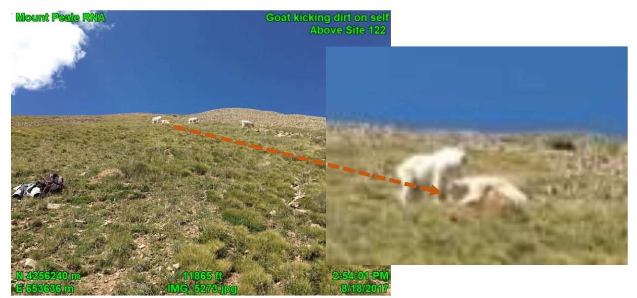
Fig. 3. Goat in wallow, kicking dirt onto itself. The dashed line-arrow points to the enlarged image of the goat kicking up dirt.

The creation and use of wallows by mountain goats results in much bare ground and loose soil that is highly susceptible to erosion from wind and water. Soil loss associated with goat wallows has been observed in other places where mountain goats have been introduced, including Yellowstone National Park (Houston et al. 1994) and Olympic National Park (National Park Service 2017).