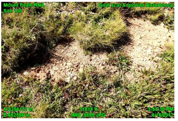
Figure A4. Mountain goat scat, ground disturbance and sheared alpine turf.