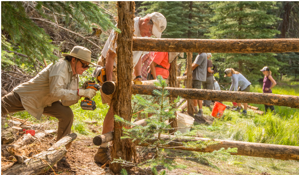
LEFT: The Bears Ears buttes. LEFT INSET: A hiker enjoys a slot canyon in Grand Staircase-Escalante National Monument. RIGHT: Volunteers build a fence around a spring on the north rim of the Grand Canyon.