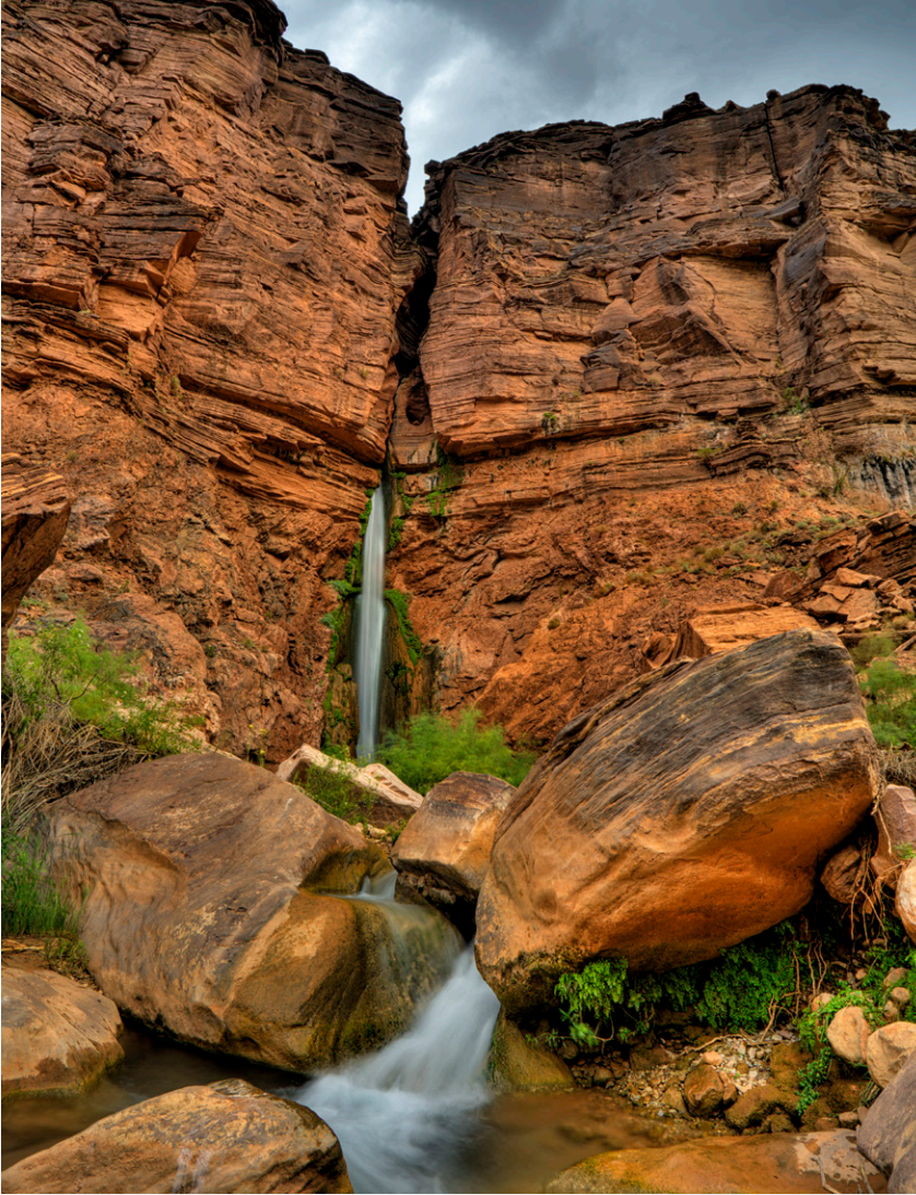
Deer Creek, Grand Canyon National Park. TIM PETERSON